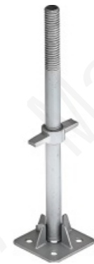
Swivel Base Jack