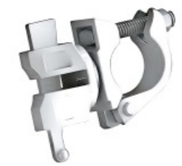
End and Coupler